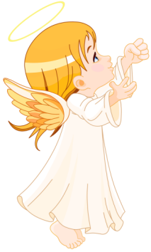
TABLE OF ANGELS

COMING SOON! Watch for the arrival of our FCHUM Angels in church before Thanksgiving. Look for more details and info on the "Table of Angels" in the back of church.